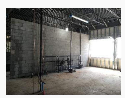
CMU Walls & Plumbing Rough