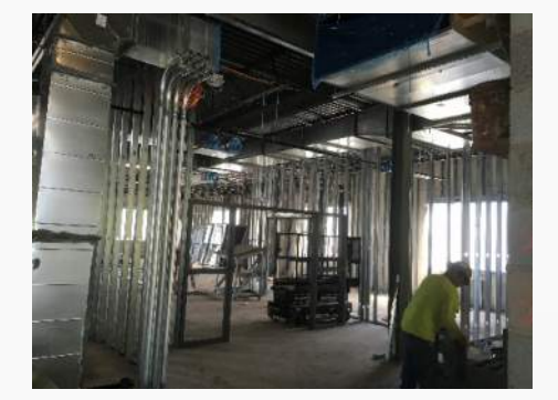
MEP Rough & Door Frames at New Building