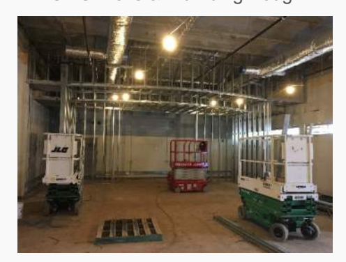
Interior Framing for Stage at Auditorium