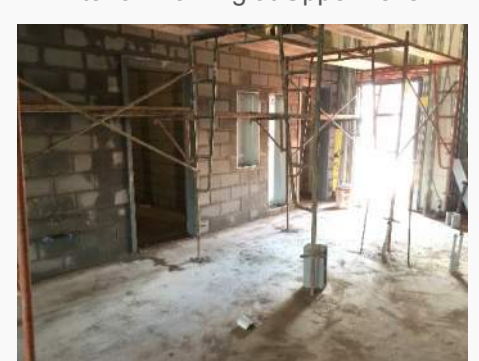
CMU Walls, Door Frames, & Elec. Panels at Kitchen