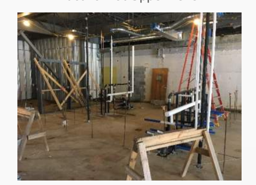
MEP Rough & Door Frames at Kitchen