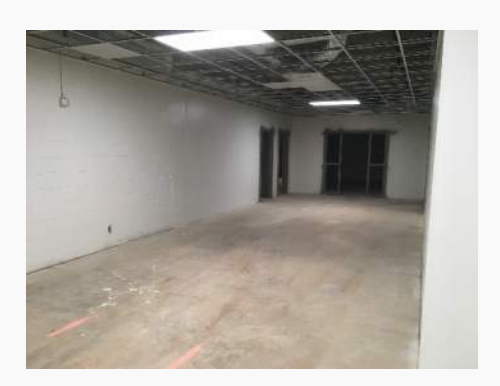
Hard Ceiling Completed at Renovation