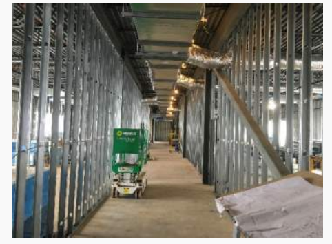
Interior Framing & MEP Rough at Upper Level