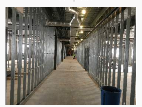
Interior Framing & MEP Rough at Lower Level