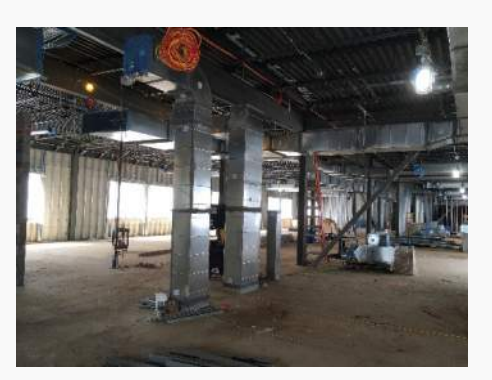
Ductwork at Upper Level