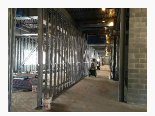
Interior Framing at Upper Level